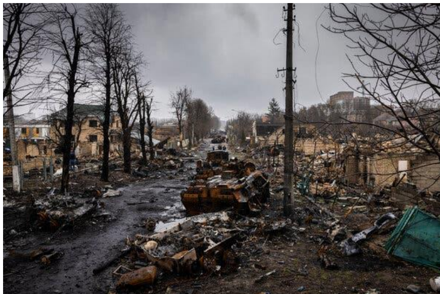
Widespread destruction across Bucha, Ukraine, on Sunday, after Ukrainian forces had allegedly targeted a Russian convoy. – April 18, 2022

Having imagined this, pray for displaced people in the world, people for whom this fantasy is a terrible reality. Pray into their loss and grief and ask God to be with them. Pray also for your country, your city and your community, that they would be places of welcome for people who have been forcibly displaced from their communities.