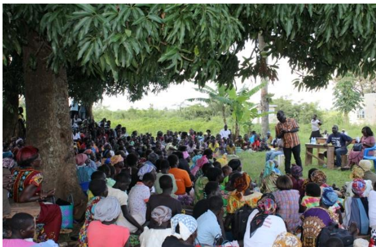
I Live Again Uganda – a Christian NGO, conducting a trauma care session for a Ugandan village

Pray for the refugees living in refugee camps and in difficult urban settings throughout Uganda – for God's provision and restoration. Pray also for peace for Uganda's neighbours. The unrest in many African countries does not make the news as much as other disasters and wars, but the challenges are very real. Of the approximately 1.5 million refugees in Uganda, more than half come from South Sudan, and over 32% come from the Democratic Republic of Congo. Others come from countries such as Somalia, Burundi, Eritrea, Rwanda, Ethiopia, and Sudan.